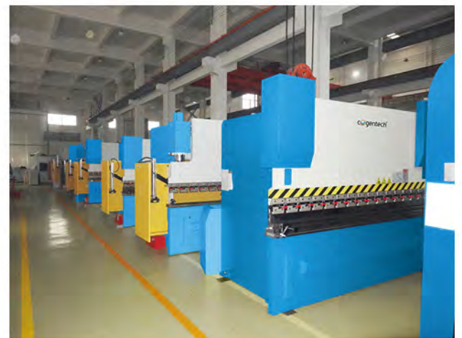
Mass production of hyd press brakes