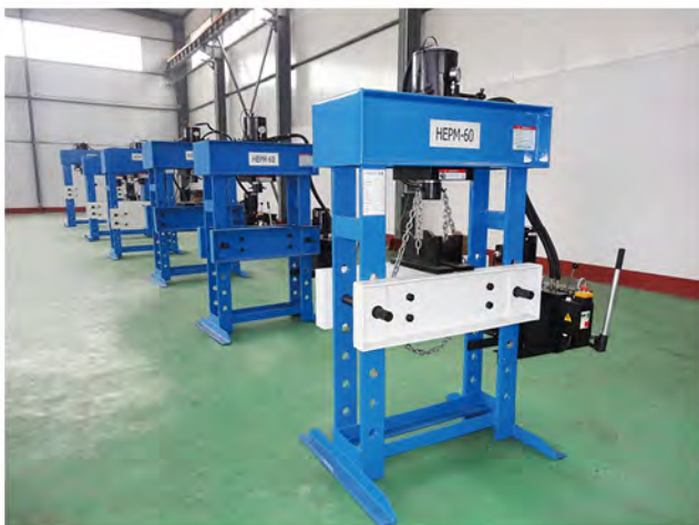
Mass production of hyd presses