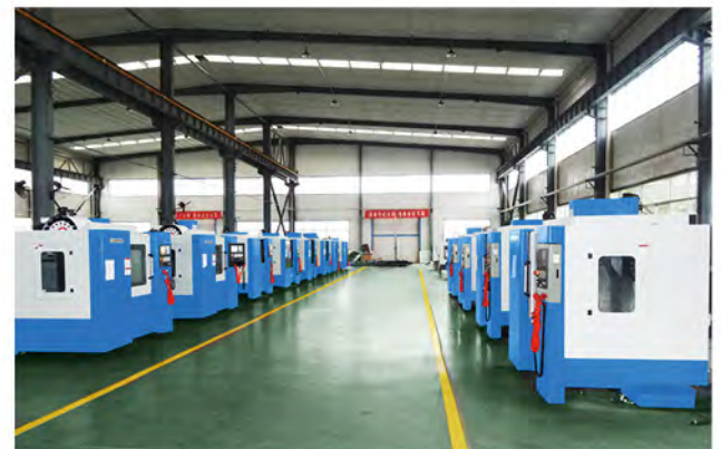
Mass production of VMC